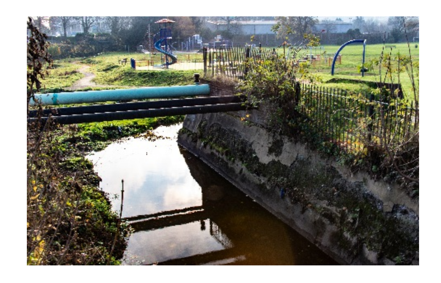
This is the reality