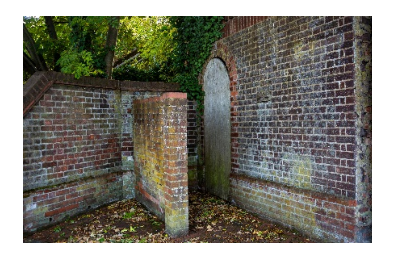
This public convenience has been boarded up for over 40 years

This public footpath, close to the town centre sums up the issues of "spin" versus reality